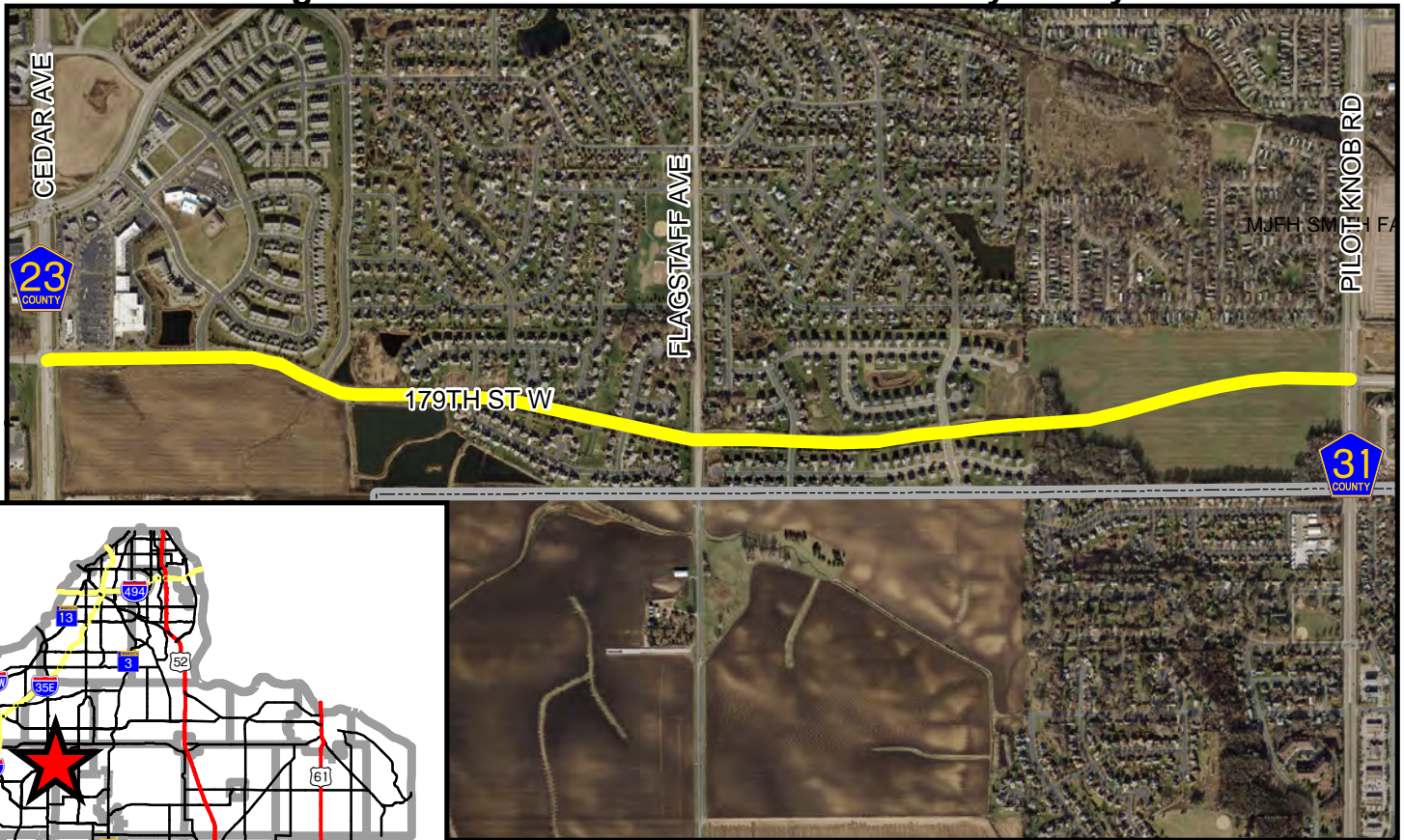
179th Street West to Pilot Knob Road - City to County

Prepared by the Dakota County Transportation Department